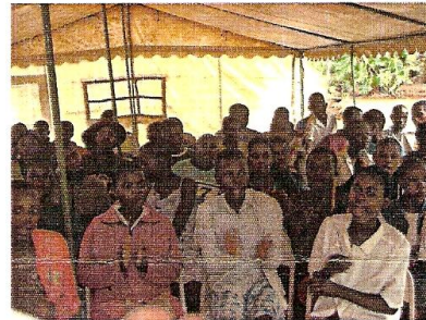
Children worshipping at the camp